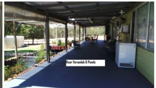
Picnic Verandah & Ponds